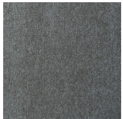
Translate - 73 Taupe