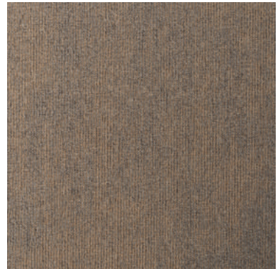
Translate - 64 Hemp