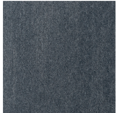
Translate - 76 Stone