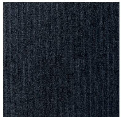
Translate - 78 Slate