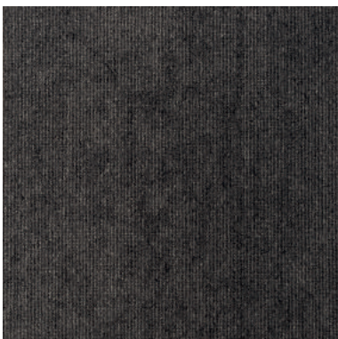
Translate - 90 Peat