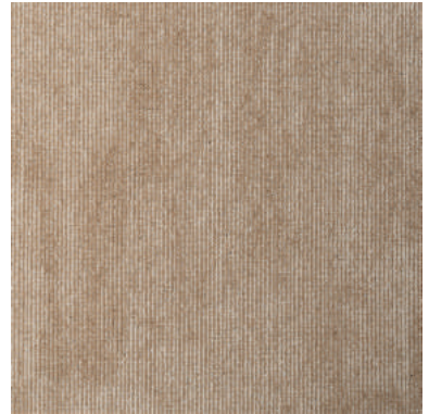
Translate - 62 Grain