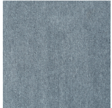
Translate - 72 Pewter