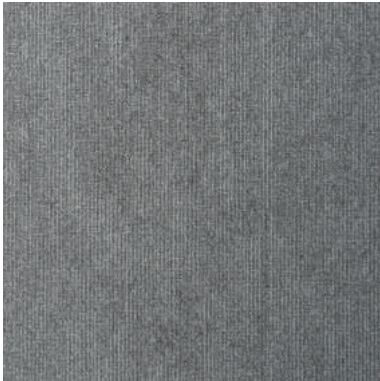
Translate - 74 Clay