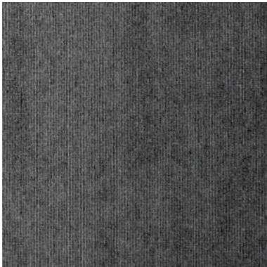
Translate - 75 Concrete